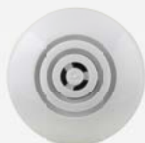
P40 A P40 A JUNIOR