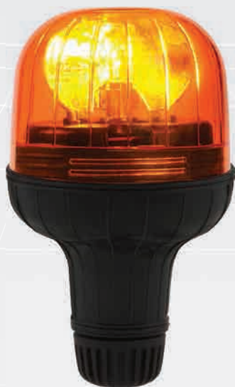
FLEXIBLE ISO A (MOUNT ON ADAPTER SOCKET)