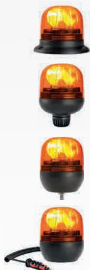
ISO B1 (FLAT BASE)