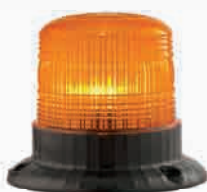
FORK PLUS LED BEACON 84667 (see page 12)