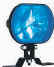
INDIGO OPTICAL DRIVING PATH WARNING DEVICE 84668 (see page 13)